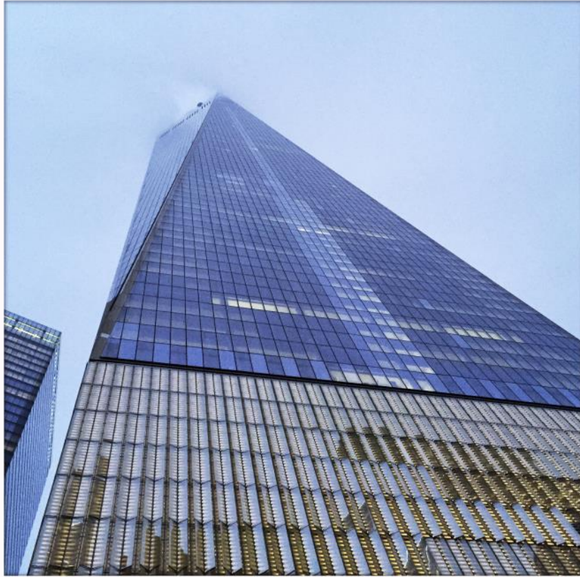
Lobby Entrance Elevation View Obelisk shape - Façade ascends to a point